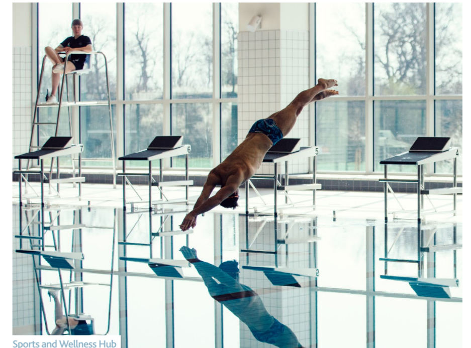
Sports and Wellness Hub