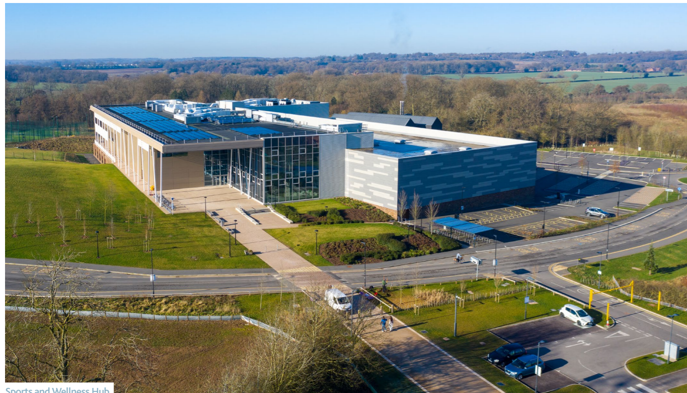
Sports and Wellness Hub