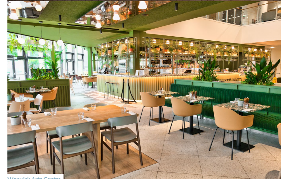
Warwick Arts Centre