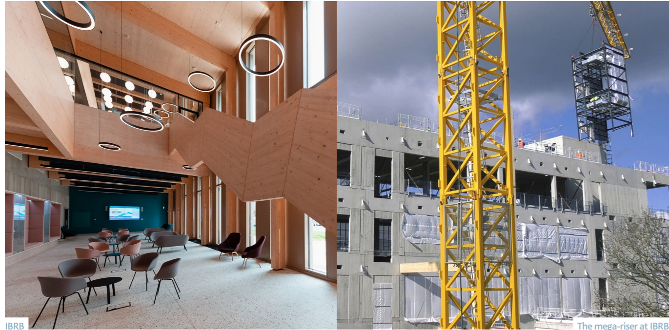
IBRB The mega-riser at IBRB