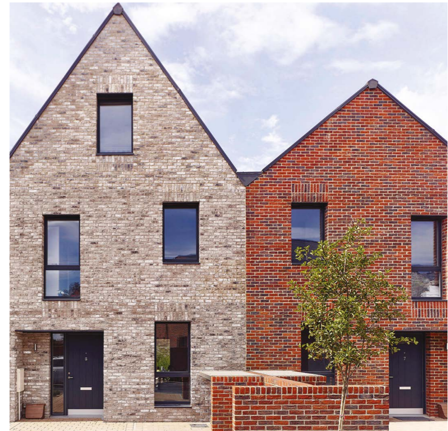
Clockwise from top left Sites of opportunity: Bruyns Court, Thurrock; Students at Stansted Airport College; New homes in Tilbury; Holiday Inn Southend; School of Medicine, Anglia Ruskin University, Chelmsford