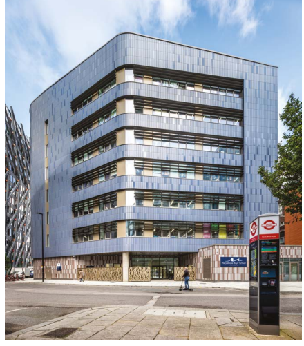
Top: The school roof has been adapted to provide an outdoor play area.

Above: At nine storeys, including the basement and games area, it is the tallest secondary school in the UK. Left: The school was the first phase of Dudley House to complete, opening in time for the 2018 academic year.