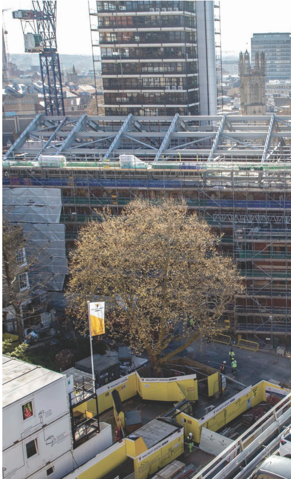
Right: Bristol's world-famous entertainment venue, the Bristol Beacon, will become the UK's first carbon neutral concert hall when its refurbishment is completed.