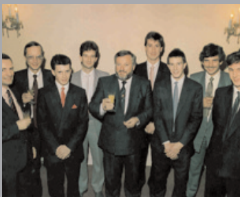
Inaugural Lunch of Willmott Dixon Distinction Club 1988