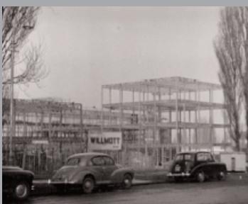
Letchworth College of Technology 1957 See Spirella Building on right behind the trees