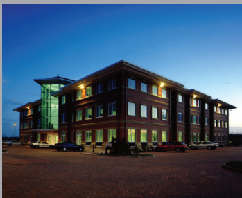
Bass Corporate Services Headquarters, Burton on Trent – 1993

With the emphasis very much on Partnering, client relationships and repeat order business, the Group focused on establishing special client relationships in sectors such as the hotel and leisure industry, and with local authorities and housing associations. Profits had steadily increased since 1995 and broke the £3m barrier in 1999 on a turnover of £245m. An ever increasing percentage of Group turnover was contracted on a partnered basis and Willmott Dixon was becoming widely recognised as industry leaders in Partnering.