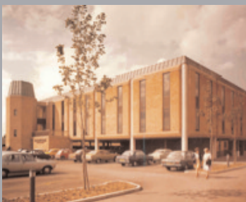
New headquarters for Provident Mutual Life Assurance in 1976

Despite a depressed national economy in the mid 1970's, the company successfully sustained their growth momentum. By 1980 they had a network of regional geographical building companies, a varied group of specialist support companies, and a small property development division. The Group turnover had increased from £2.2m in 1970 to £29.8m in 1980.