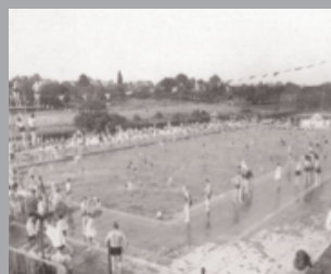
The Ozone Swimming Pool, Letchworth