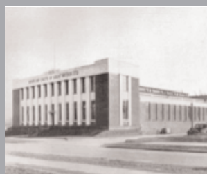
Irving Airchute Factory, Letchworth