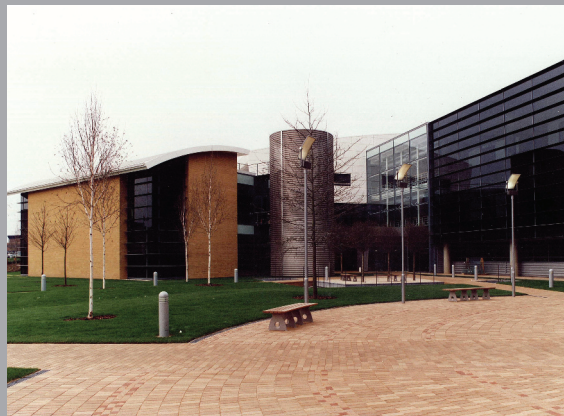
The 3com project, built in 1998 in Hemel Hempstead, was a successful Partnering project that helped pave the way for the business to become an industry leader in Partnering.