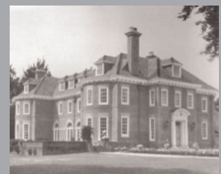
Burloes Hall, Royston