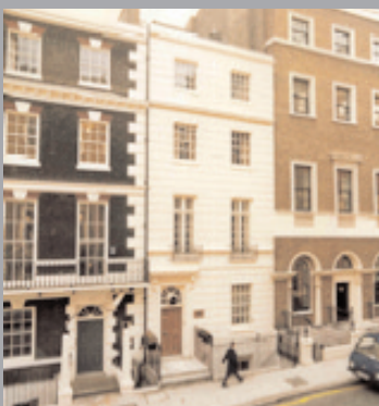
Head Office in 1984, 34 Upper Brook Street, London W1

In 1984 the company joined a consortium of four partners to form Camtech Developments Limited with the original intention to develop a High Technology Science Park on 56 acres of land on the outskirts of Cambridge. The other three partners were Architects Lister Drew & Associates, Quantity Surveyors Bridgewater & Coulton, and Surveyors Young & Company. After negotiating a rather long and tortuous path through complex planning issues with Cambridgeshire County Council over several years, the site was eventually sold to Sainsbury's in 1991 and provided an excellent return on the investment.