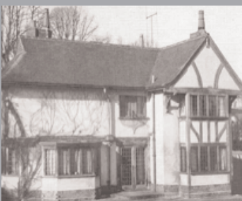
"Oakfield" Coach Drive, Hitchin