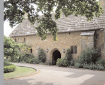
Bailiffscourt Hotel in 2008

Bailiffscourt, which is now Grade II listed, is currently owned by Historic Sussex Hotels. They value the, albeit pseudo, medieval architecture and have retained and highlighted the unusual features commissioned by Lord and Lady Moyne.