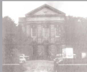
Former Hitchin Congregational Church

Although the offices at 80 Walsworth Road, Hitchin, had been extended by the purchase of the adjoining property at No. 81, the company had outgrown this space and looked at several options for larger accommodation. Constructing a new building on land owned by the company at The Cutting beside Hitchin Railway Station was considered but rejected and it was finally decided to purchase the site of the Hitchin Congregational Church in Queen Street, where an earlier generation of the Willmott family had worshiped in the early 1900s. Planning permission was granted to demolish the church and build two 2-storey office blocks, and application had to be made to the Home Office for approval to move graves in the adjoining graveyard. The new head office was built using the steel framed S.E.A.C. building system marketed by the British Steel Corporation. The company had recently joined a consortium to construct schools, offices and industrial buildings using this S.E.A.C. system which operated through a subsidiary named Systems Construction (UK) Limited.