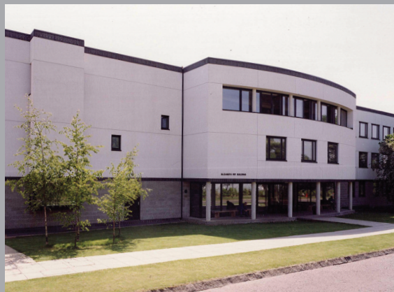
Built for the University of East Anglia in 1999, Elizabeth Fry House is still regarded as one of the most sustainable buildings ever built.