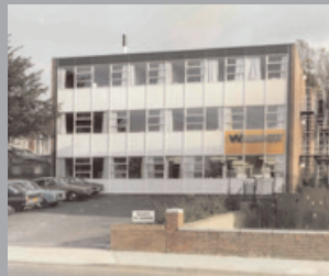
New Willmott Offices, Queen Street, Hitchin 1971