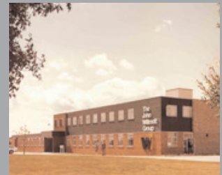
New Offices at Henlow 1978

The company moved into the new offices at 43 Queen Street in June 1971 but within a few years it was decided to relocate to premises where the joinery and plant operations could be accommodated on one site and to dispose of the premises at Walsworth Road and The Railway Cutting. Therefore in 1975, ninety-seven years after the company had become established in Hitchin, they moved out of the town to a site at Henlow in Bedfordshire which was purchased from a pyramid sales company called Golden Chemicals.