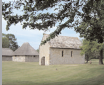
13th Century Chapel at Bailiffscourt restored by Willmotts in 1930