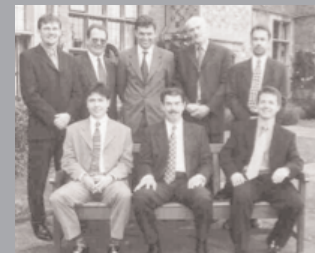
Participants of the pioneering postgraduate Design & Build course at the University of Luton