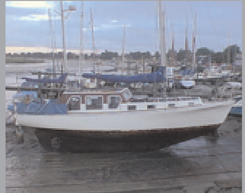
...and after a refit and a new name in 2001