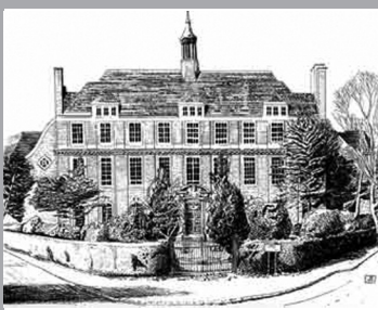
Brighton Hove and Sussex Grammar School